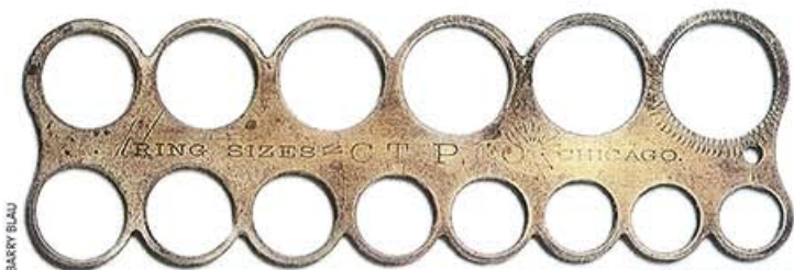
Antique ring sizer