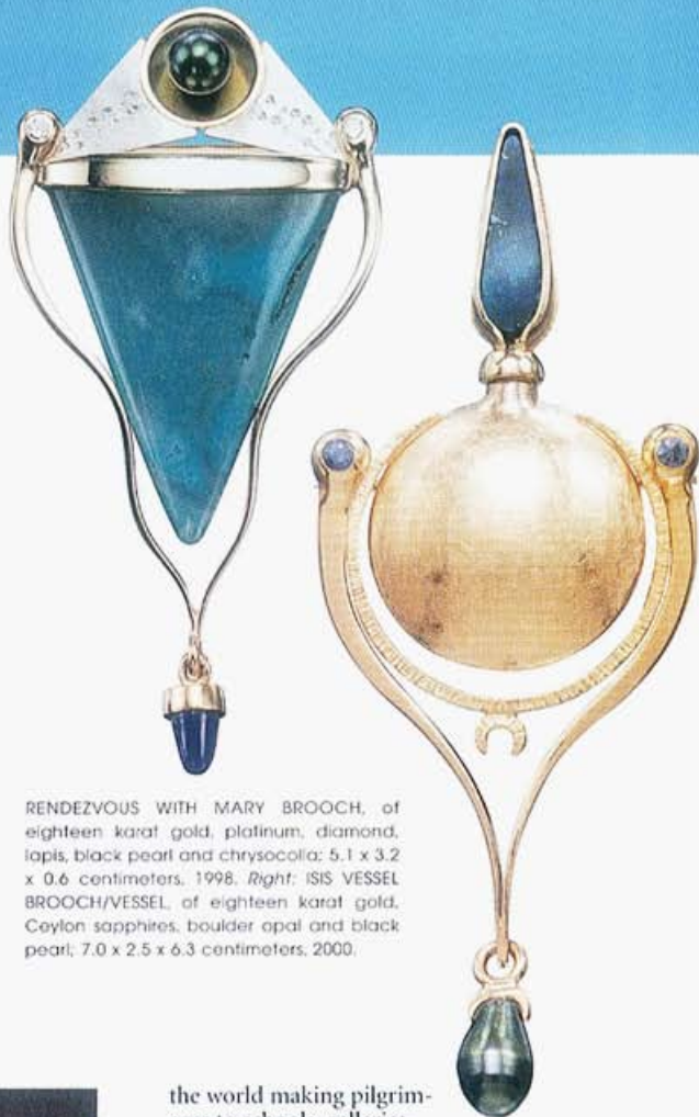
RENDEZVOUS WITH MARY BROOCH, of eighteen karat gold, platinum, diamond, lapis, black pearl and chrysocolia; 5.1 x 3.2 x 0.6 centimeters, 1998. Right: ISIS VESSEL BROOCH/VESSEL, of eighteen karat gold, Ceylon sapphires, boulder opal and black pearl; 7.0 x 2.5 x 6.3 centimeters, 2000.