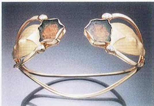
LOTUS BRACELET, of eighteen karat gold, diamonds and watermelon tourmaline; 5.7 x 6.3 x 2.5 centimeters, 2000. Wayne Werner's jewelry ranges in price from six hundred fifty to forty-two hundred dollars.

the world making pilgrimages to schools, galleries, museums and artists of the highest caliber. My greatest joy comes from sitting down with an experienced metalsmith gaining knowledge passed down through time. I have done this from the back alleys of old Cairo, Istanbul and Florence to the kris makers in the jungles of Java. There is something very grounding about this means of study; it reminds me how much I love my job and how blessed I am to possess talent.